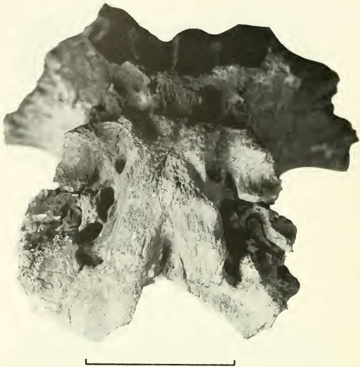
Fig. 6. Ventral surface, PM 526. Rostral direction toward top. Line represents 10 cm.

median groove divides the caudal half of the basioccipital into right and left halves (Fig. 6). Measurements of selected characters are given in Table 1.